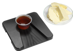
Figure 2. – Disposable Dish